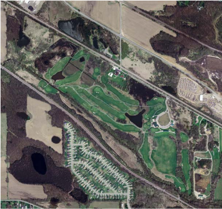
Creekside Golf Course Aerial Photograph