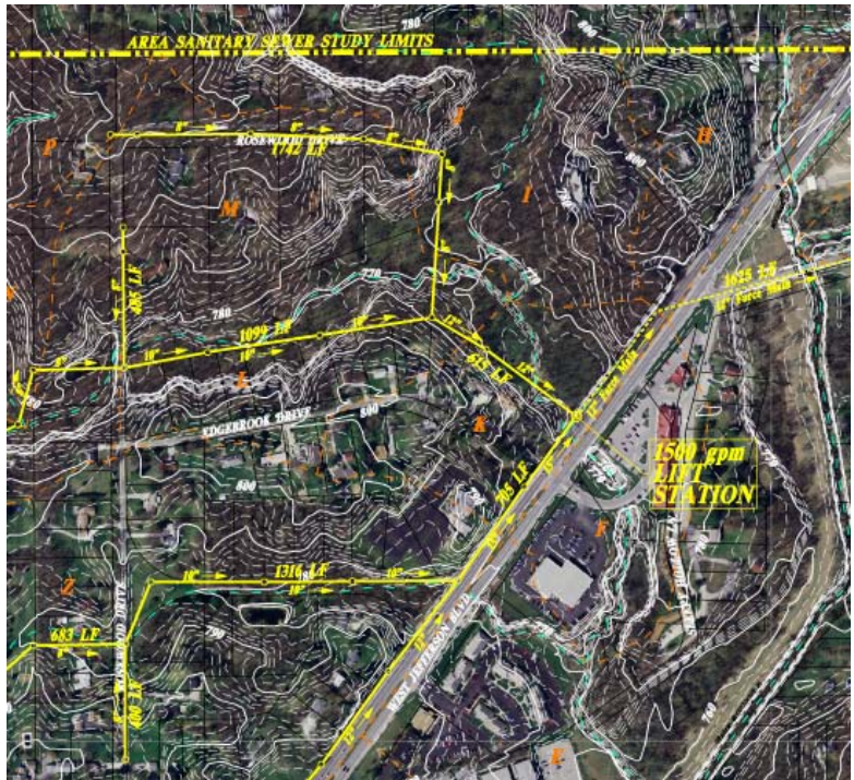
Partial Preliminary Plan View-Gravity Service Alternative

Finally, the preliminary system plan-view sheets with a cost estimate and discussion of probable total cost to the existing 315 homes within the study area were delivered to the City of Fort Wayne for their review and comment. A meeting was held to discuss the alternatives and provide insight into the various choices for Sanitary Sewer Service to this area.