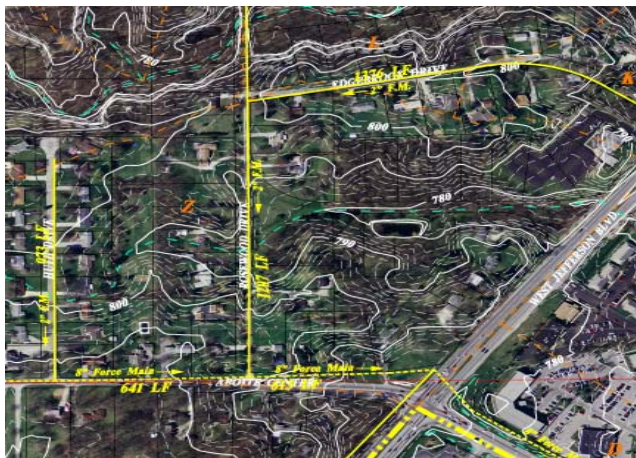
Partial Preliminary Plan View-Low Pressure Force Main Alternative