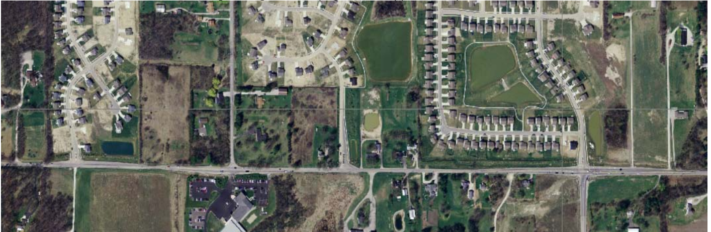
Aerial Photograph of the Project Corridor

The estimated construction cost of the improvements to the surrounding streets for this project was approximately $500,000, while the engineering and surveying cost was approximately $30,000.